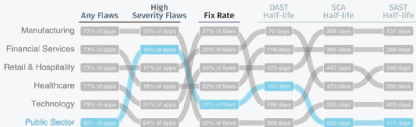
Figure 1: Values and rankings for key software security metrics by industry.

Veracode’s 12th annual State of Software Security report indicates that 82% of applications used in the public sector have at least one security flaw, a rate that is higher than the average across all private sector industries. (At 76%, however, the private-sector track record isn’t much better.)